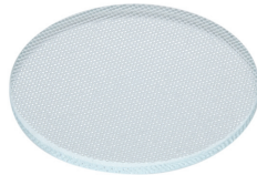
991 - SOFTENING LENS