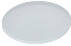
990 - SANDBLASTED LENS