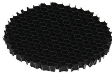
995 - HONEYCOMB LOUVRE