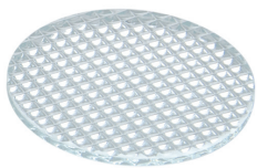
996 - PRISMATIC LENS