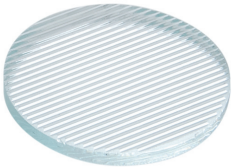
992 - LINEAR FILTER